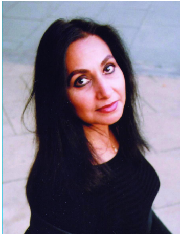
Judge of the Foyle Young Poets of the Year Award 2011 Imtiaz Dharker

"I wish Bob Dylan could take a look at the work being produced by the Foyle Young Poets; he'd see that, like him, they see the world in a new way, they use language that sparkles and shines and they know how to grab an audience's attention. In years to come I'm sure that phrases created by some or all of Foyle Young Poets will be part of the language like Dylan's lyrics are."