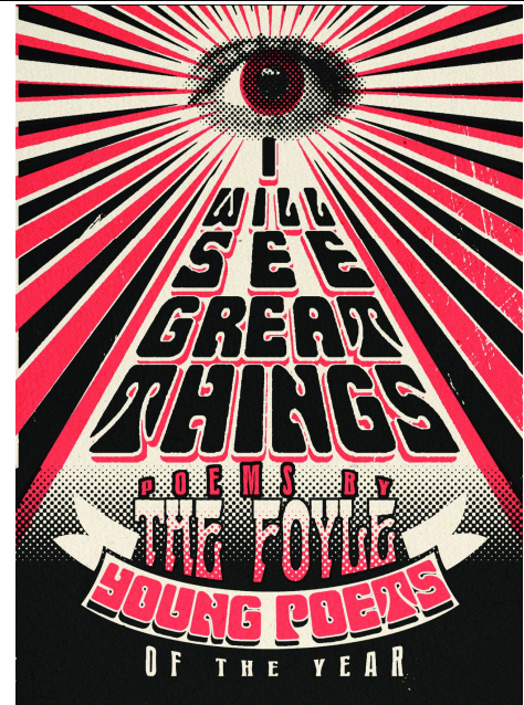
I Will See Great Things: Poems by The Foyle Young Poets of the Year, anthology book cover

Survey reveals what truly drives the creative mind